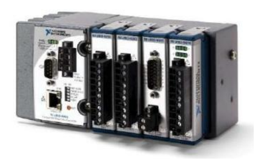
Figure 2. NI CompactRIO Platform

When used with the small, rugged CompactRIO embedded control and data acquisition system, C Series analog input modules connect directly to reconfigurable I/O (RIO) field-programmable gate array (FPGA) hardware to create high-performance embedded systems. The reconfigurable FPGA hardware within CompactRIO provides a variety of options for custom timing, triggering, synchronization, filtering, signal processing, and high-speed decision making for all C Series analog input modules. For instance, with CompactRIO, you can implement custom triggering for any analog sensor type on a per-channel basis using the flexibility and performance of the FPGA and the numerous arithmetic and comparison function blocks built into the NI LabVIEW FPGA Module.