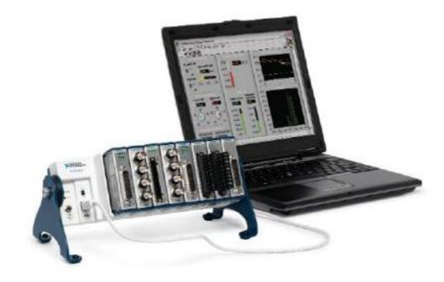
Figure 1. NI CompactDAQ Platform