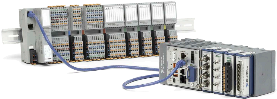
Figure 1. NI Remote I/O System