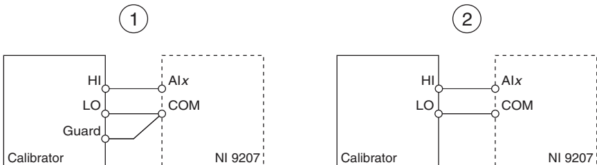
Figure 2. Current Accuracy Connections